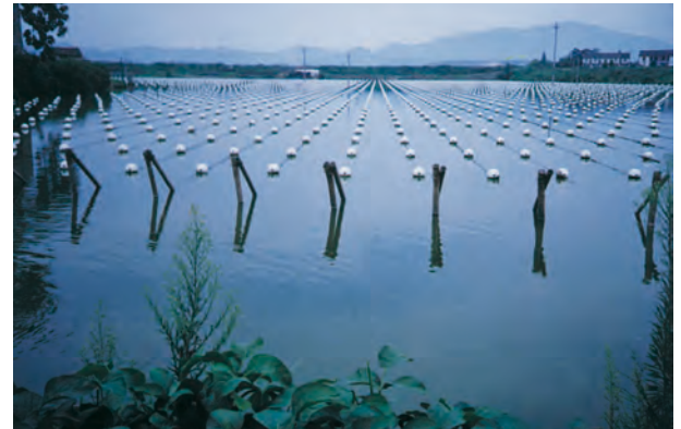
Freshwater pearl lake.