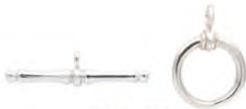
ST BAR & RING